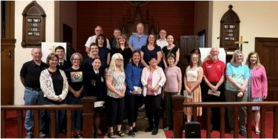
Historical Society, Thurmont Parks & Recreation Committee, Thurmont Regional Library and Thurmont Senior Center, Inc.